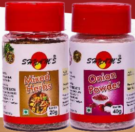
Onion Powder 40g