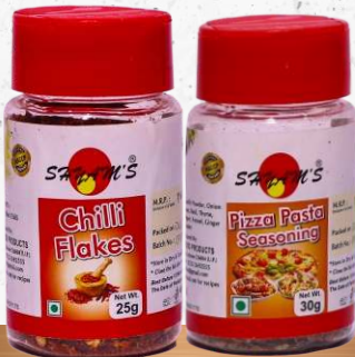
Chilli Flakes 25g