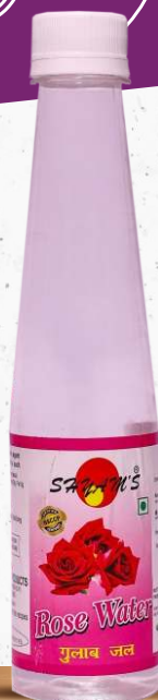
Rose Water 275 ml