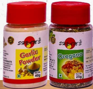
Garlic Powder 40 g