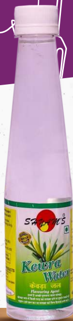
Kewra Water 275 ml