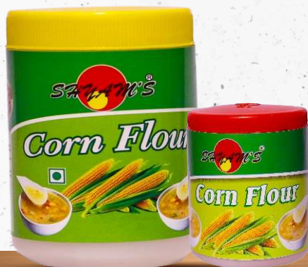
Corn Flour 500g, 100g